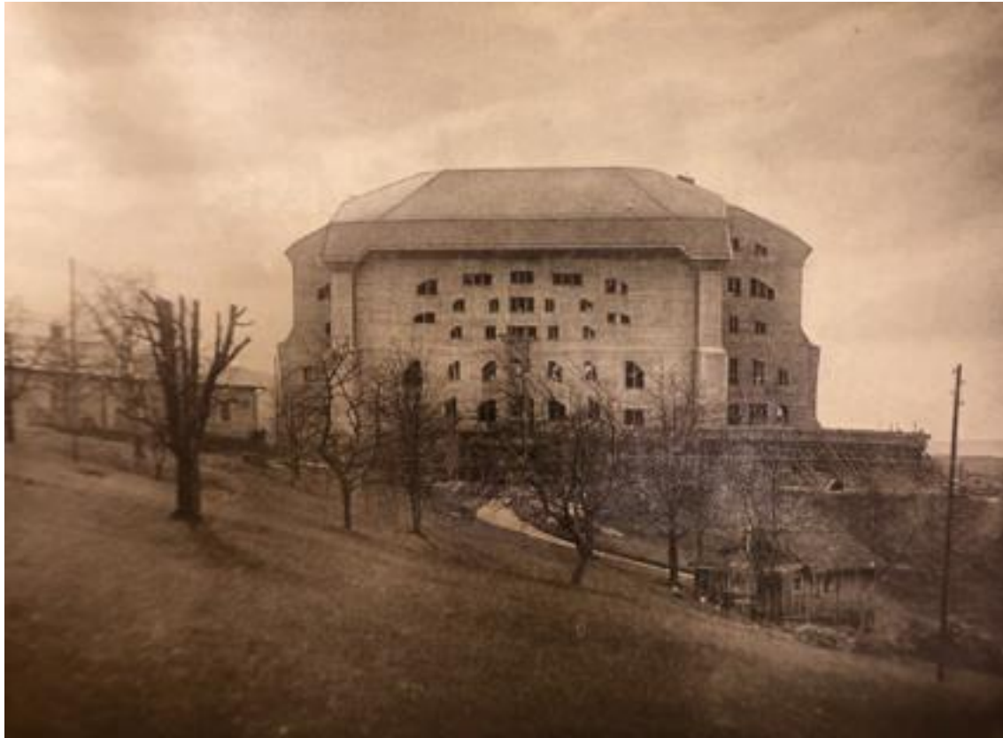
Fig. 4. Rear view of the Goetheanum in 1927 (detail).

Funds were still an issue, as they would be forever more: “Of the original appeal for about 1,950,000 francs for the erection of the building in its simplest structure, about half has been contributed in this last year. We could reach our goal if another 1,000,000 francs were given in 1927” (Vorstand, 1927) (Fig. 5).