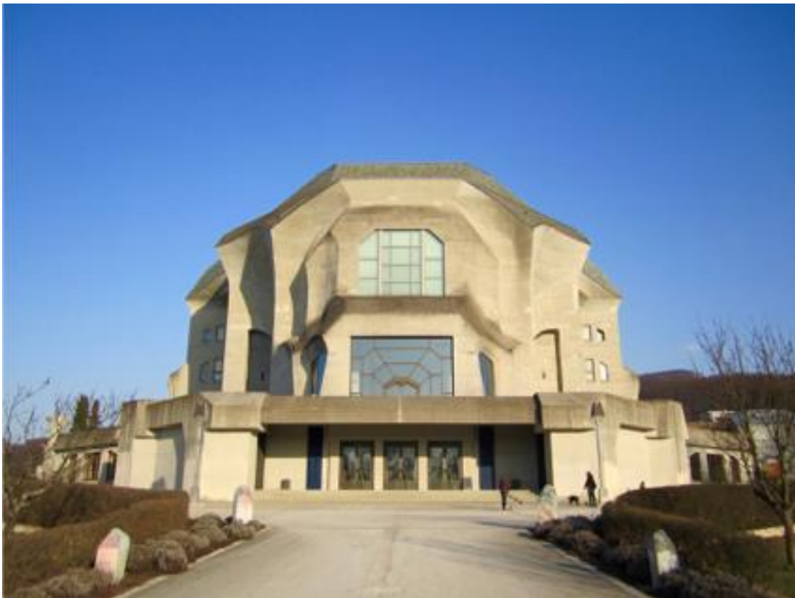
Fig. 8. Goetheanum exterior, front view.