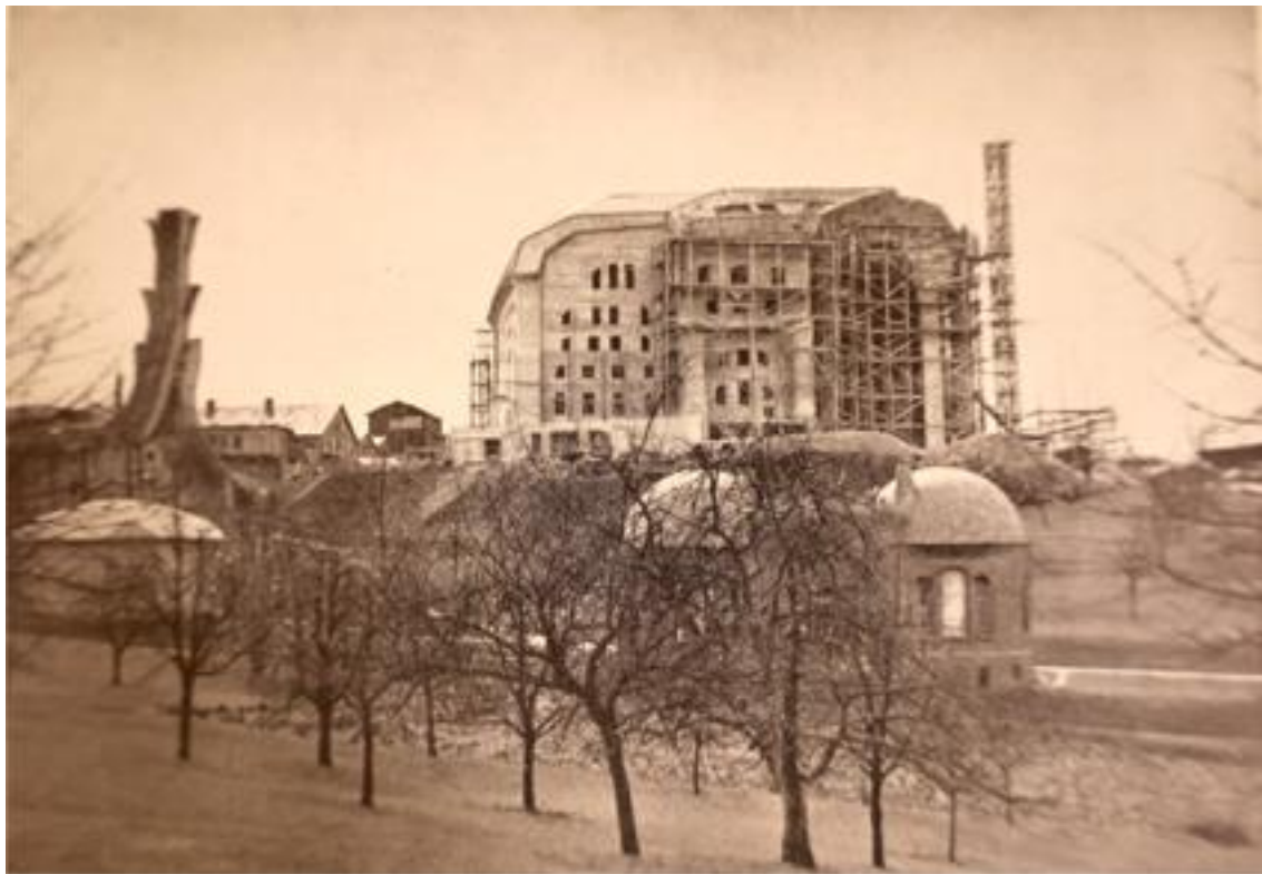
Fig. 5. Fund-raising image of the Goetheanum, rear view, with Glashaus in the foreground on the right, and Heizhaus on the left, in 1927 (detail).

Funds were still an issue, as they would be forever more: “Of the original appeal for about 1,950,000 francs for the erection of the building in its simplest structure, about half has been contributed in this last year. We could reach our goal if another 1,000,000 francs were given in 1927” (Vorstand, 1927) (Fig. 5).