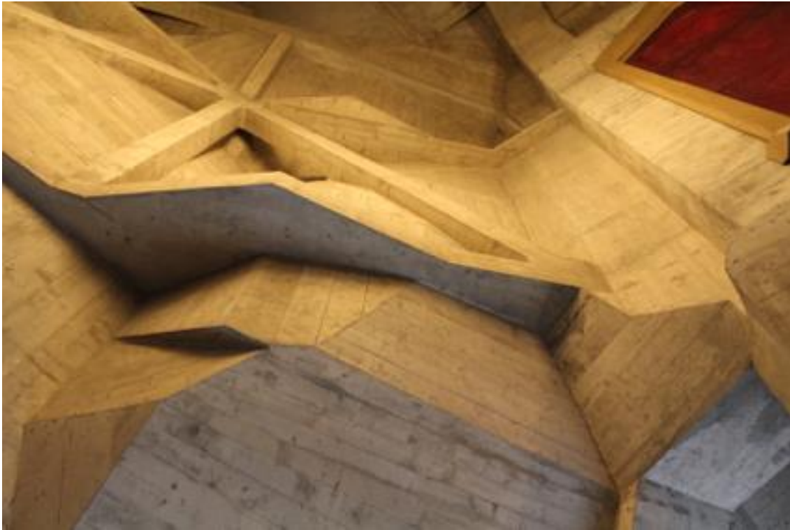
Fig. 7. Goetheanum interior, showing impressions on the concrete of the timber shuttering (formwork).