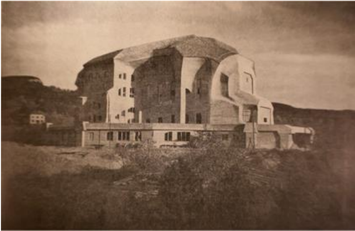
Fig. 6. The Goetheanum exterior is completed for the Opening in 1928 (detail).

The ‘Anthroposophical Movement’ weekly reported: “The chief event of the year which can rightly fill us with hope in spite of all adverse circumstances was the Opening of the Goetheanum at Michaelmas. It was attended by nearly 100 English members ... Those English members who have been to the Conferences arranged by the Vorstand at the Goetheanum are the best missionaries to bring home to individual members in all localities what the Goetheanum is for us all and for the world” (Executive Council, 1929).