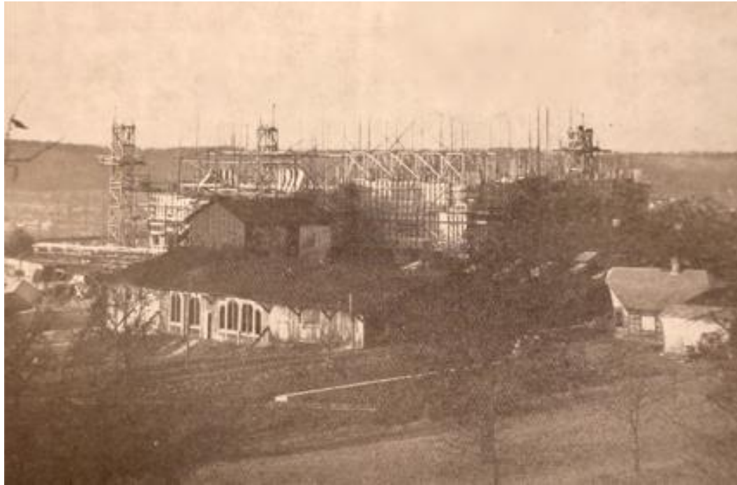
Fig. 1. Goetheanum scaffolded, with the Schreinerei in the foreground, in 1926 (detail) (source: Editor, 1926).

On February 1926, photographs in The Weekly News Sheet reveal the new Goetheanum well underway, with scaffolding all around, the stage in the course of construction, and a lecture hall and rehearsal room with floors, walls and roofed ( Weekly News Sheet , 1926). Elisabeth Vreede could report “the second Goetheanum is growing up ... erected on the Foundation Stone of the old building” (Vreede, 1926, p.71). There was optimism: “only the Goetheanum can provide the citadel of the future” (Stuten, 1926, p.75). The actors were upbeat for completion: “Full of hope and anticipation, our eyes gaze every day at the growing building ... Until then our artistic work is being carried on in five buildings scattered over the country-side, limited by lack of space and many other hindrances... in the Schreinerei, few realise under what cramping difficulties these performances have had to be prepared” (Gümbel-Seiling, 1926) (Figs.1&2).