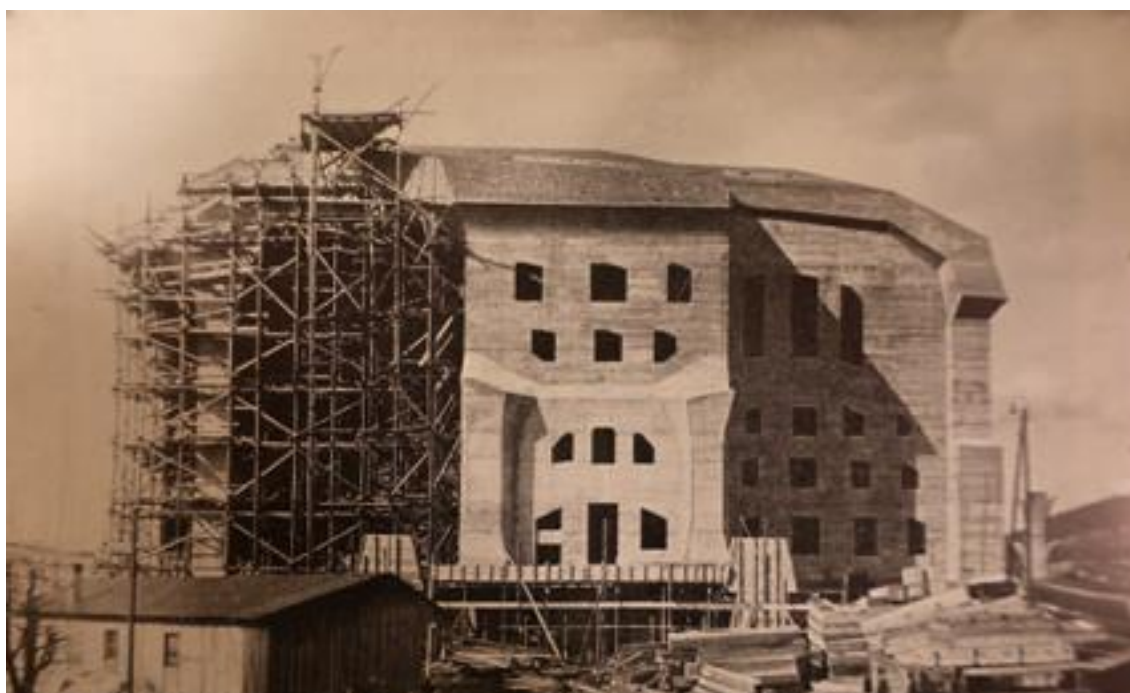
Fig. 3. The Goetheanum takes shape, south wall, in 1927 (detail).

In January 1927, a local newspaper reported: “During the last few days, the roof over the two main parts of the new Goetheanum - the hall and the stage - has been finished, and a definite stage in the erection of this greatly-desired theatre has thus been reached. The entire building ... is of reinforced concrete, and is, of its kind and in its vast dimensions, one of the most interesting buildings recently erected in Switzerland ... the Solothurn Association of Architects and Engineers paid a visit to the site ... Under the guidance of the chief architect, Herr Aisenpreis, supported by Herr Ebbell of the Engineering Firm, Leuprecht and Ebbell of Basel ... the building was inspected from top to bottom ... About 15,000 cubic metres of concrete have been used, for which no less than 1,700 railway-trucks of sand and gravel, and about 450 trucks of cement were required ... The main girders over the great hall stretching over 30 metres ... made a great impression on all visitors ... the scaffolding was still here, and the low-lying terraces which will surround the structure were still missing ... One felt that in spite of its great size, the building would fit comparatively well into the landscape. Indeed, the many and severe misgivings which were expressed in this respect would seem to have been without foundation” (Zeitung, 1927).